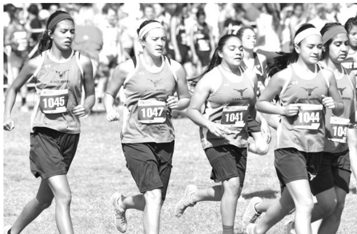
Yearbook photo On the run - Ladyhorns at the State Cross Country Meet.